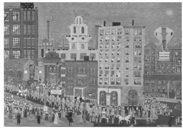
Lawrence 1912: The Bread and Roses Strike*